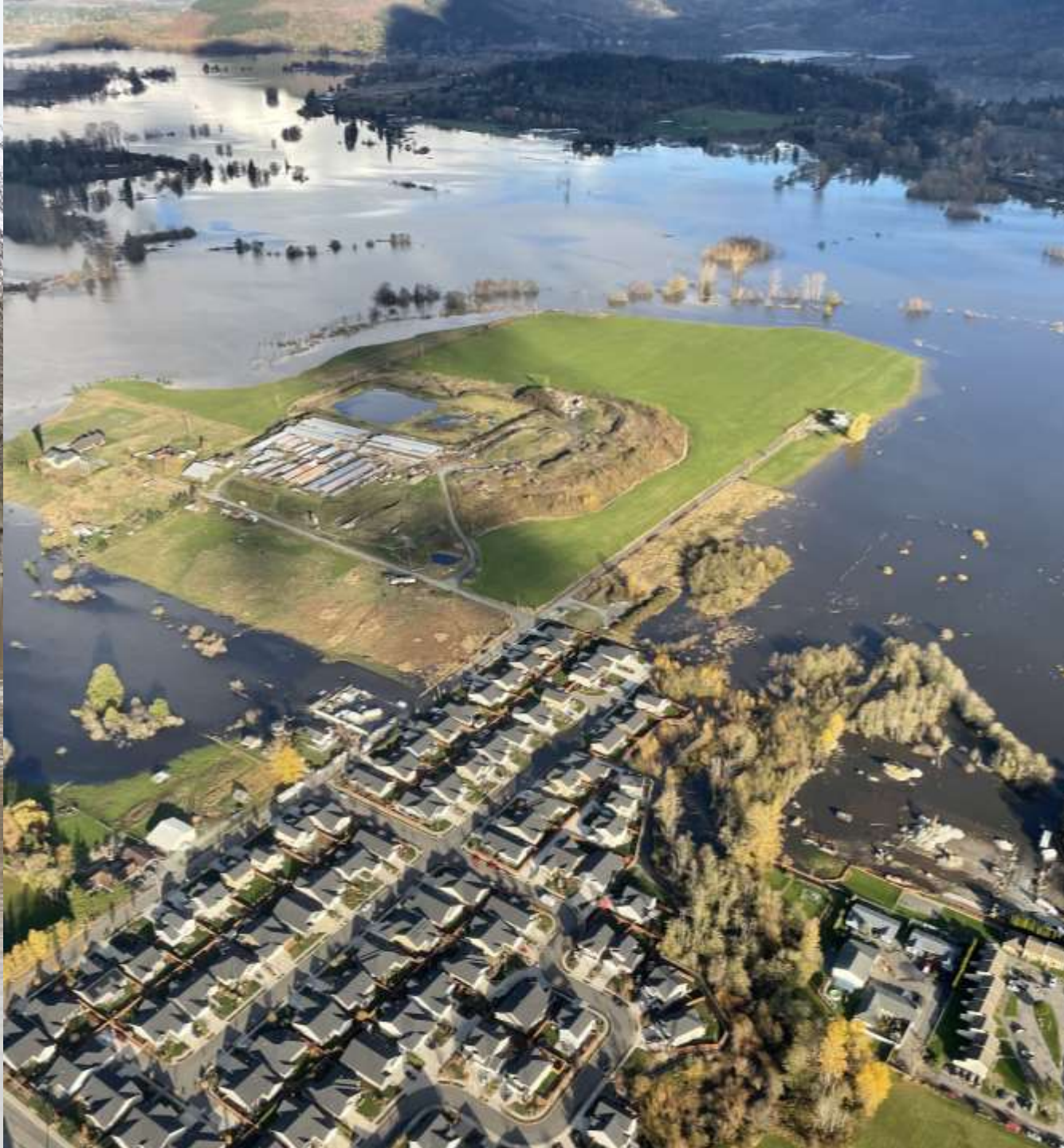
Merced CA, 2023