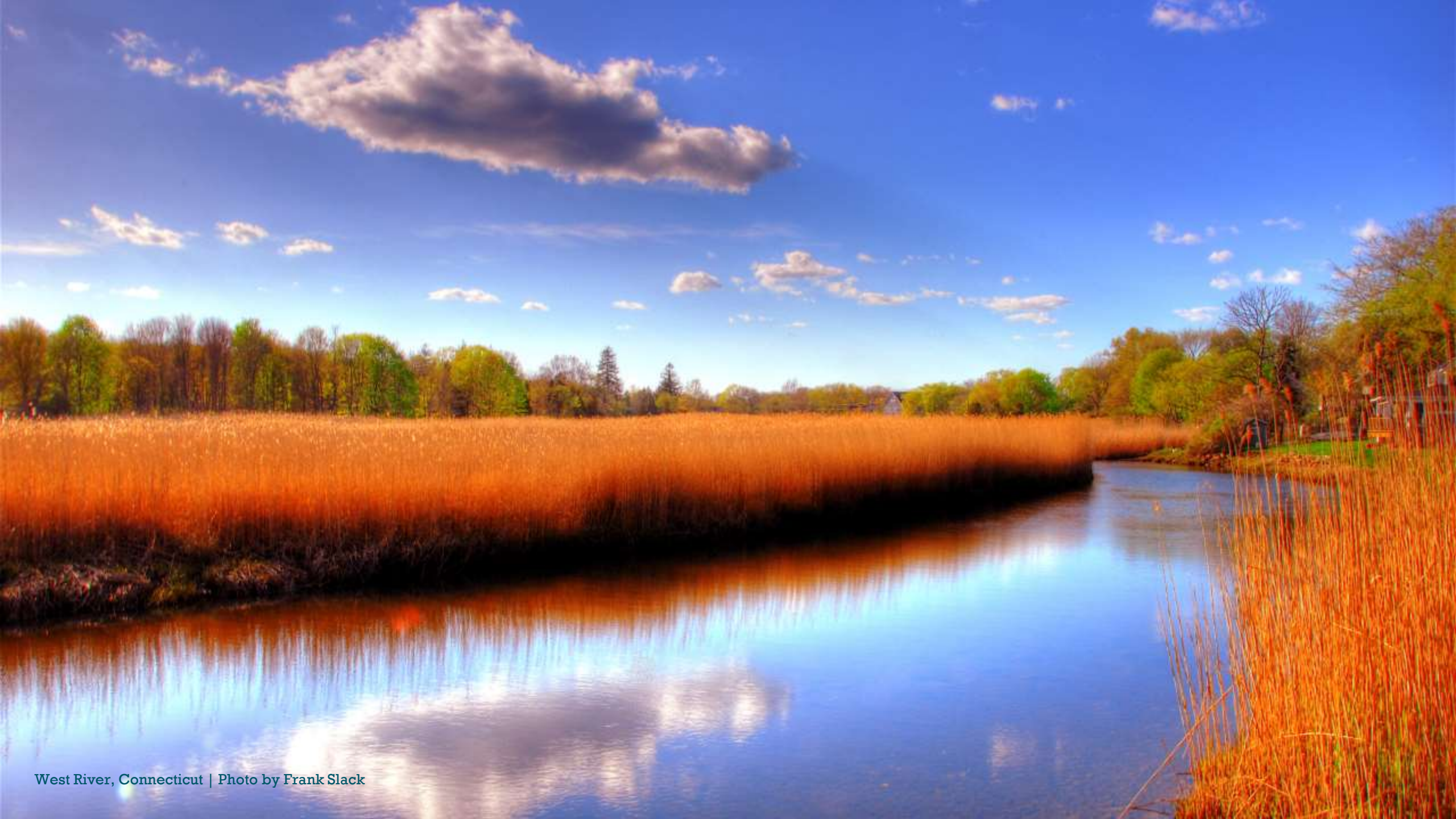
West River, Connecticut