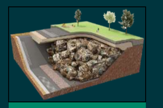
Landfills and Leachate