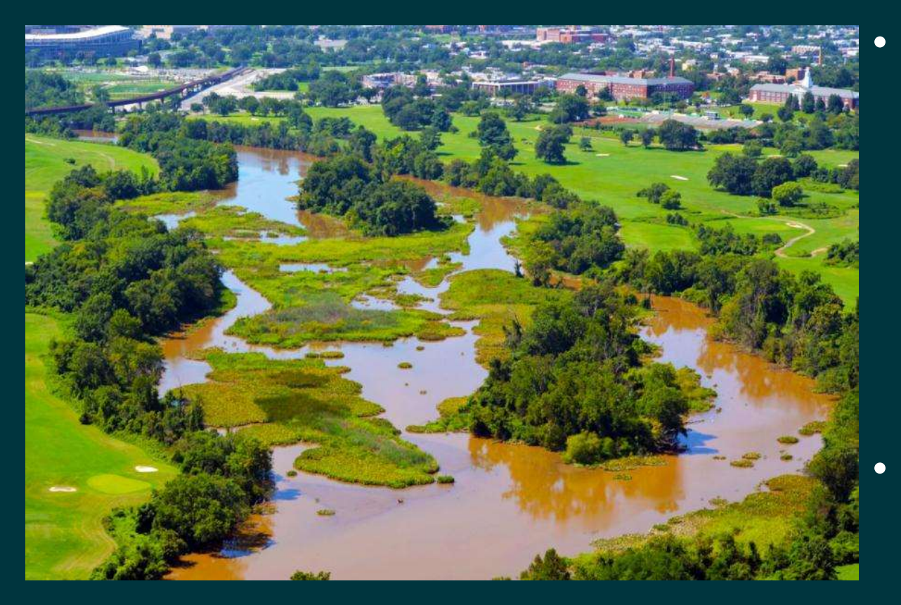
Kingman Island Wetland Restoration

Existing PFAS treatments are highly effective, but there is certainly room for improvement to identify passive restoration opportunities. Stream and wetland restoration is aesthetically attractive and could be cheaper as a long-term solution.